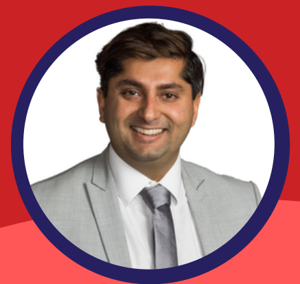
Mr. Himanshu Gulati

Hon. Member of Parliament, Kingdom of Norway Member: The Standing Committee of Education and Research